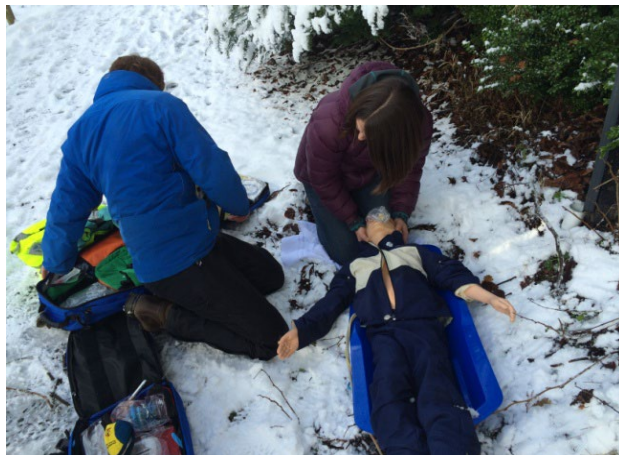
Training on the Remote & Rural Fellowship Programme

The Rural Fellow will also be able to attend local PLT events, along with various CHSCP meetings.