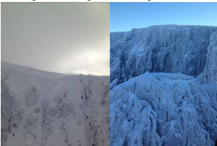
An icy Coire an t-Sneachda and Ben Nevis