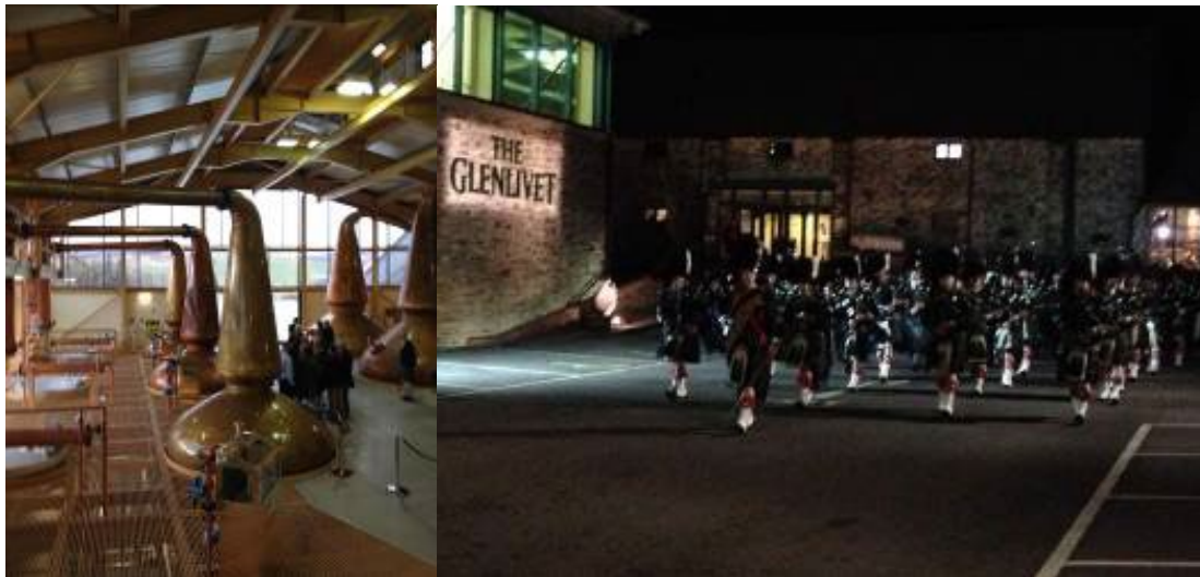
The stills of Glenlivet distillery and beating the retreat