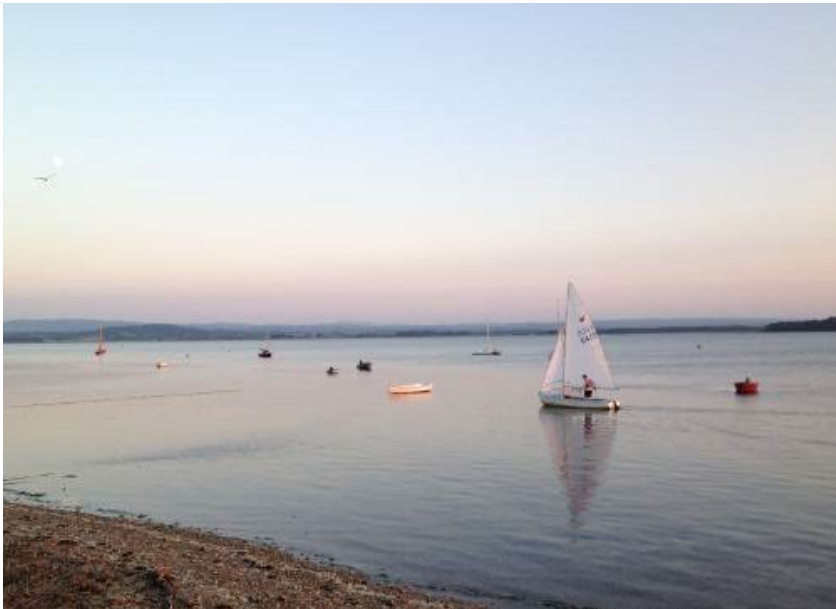
Sailing at Findhorn Bay